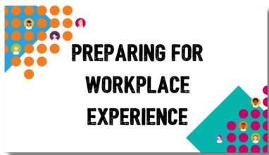
Slide deck (editable) which includes a short film